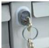
40681 - Replacement BEST Lock for Standard and OptimAL Line Med Carts 40682-KEY** - Replacement Key for BEST Cabinet Lock

**Please Supply Key Number BEST, is a registered trademark of Stanley Security Solutions