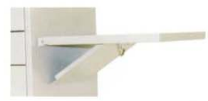
680303 - Drop Shelf with out lip 680304 - Drop Shelf with lip Dimensions: 15.25"H x 15.25"W x 18"D (SL, AL and VL medication carts only)