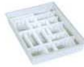
68620-P1 Drawer Tray with Adjustable Dividers for the Mini Line Carts ML180PC and ML180PCN