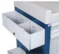
AL2360 - Cup and Straw Holder, two sections, with lid AL2361 - Cup and Straw Holder, two sections, without lid Dimensions: 5.5"H x 19.5"W x 5"D