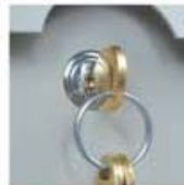
40696 - Replacement Illinois Lock for Value and Standard Line narcotics boxes 40723-KEY** - Replacement Key for narcotics Box