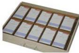
680540 - Multi-Dose Divider Set MD30-4K and MD50-6K (1 per drawer) Dimensions: 23"W x 17"D 680545 - Multi-Dose Divider Set SL72MD (1 per drawer) holds 12 bins Dimensions: 27.5"W x 17"D