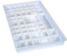
68630 - P1 Drawer Tray with Adjustable Dividers for the following Medication Carts: SL480PC, AL460PC, SL300BOX, AL300BOX