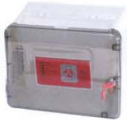
684810 - Locking Sharps Holder, includes 5 Quart Sharps Container 40835 - Replacement Locking Sharps Box 40837 - Replacement 5 Quart Sharps Container