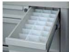
680551 - Drawer Divider Set for small 4" drawer in OptimAL and SL carts. Designed to hold eye-drops and ointments, etc.