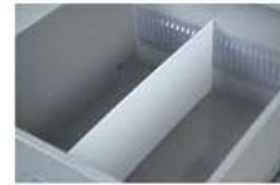
Punch Card Row Dividers 40603 - Value Line Carts (1 each) 40611 - Classic, Mini and GP Carts (1 each) 40612 - Standard, OptimAL and Wood Carts (1 each) 684190 - Vinyl strip with tape (set of 2)