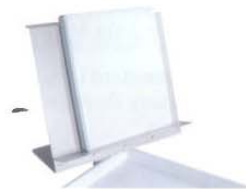
AL-CHARTHLDR - Chart Holder, mounts to back of cart, swivels