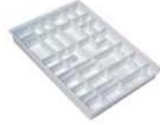
68530-P1 Drawer Tray with Adjustable Dividers for the Value Line Medication Carts and Classic and E-Series Carts VL280PC, VL280MPC, and all VL Bin and Box Carts