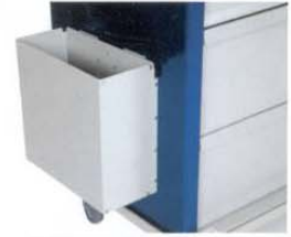
AL680435 - Aluminum Waste Container, with out lid. Includes mounting hardware AL680436 - Aluminum Waste Container, with a lid and mounting hardware