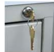
40406 - Replacement Cabinet Lock for Value Line carts 40693-XXX** - Replacement Key for VL cabinet lock