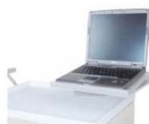
680325 - Laptop Shelf, mounts to back of cart, adjustable height, swivels (VL, E-Series and Classic Line carts only)