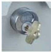
40680 - Replacement BEST Lock for Narcotics Boxes on OptimAL Line Carts 40682-KEY** - Replacement Key for narcotics box

**Please Supply Key Number BEST, is a registered trademark of Stanley Security Solutions