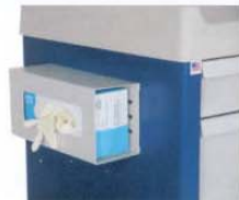
AL2362 - Aluminum Glove Box Holder