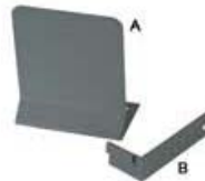
(A) AL2365 - Pill Card Ends, Set of 4 (B) 640622 - Punch Card Holders, Set of 3