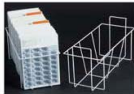
640346 - Exchange Basket for punch cards, capacity of 33 cards