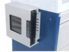
AL2366 - Notebook Holder, Aluminum Dimensions: 12.5"H x 12"W x 5"D