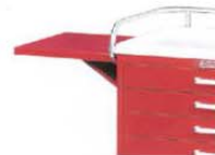
680301 - Drop Shelf with out lip 680302 - Drop Shelf with lip Dimensions: 15.25"H x 15.25"W x 18"D (Classic Line carts only)