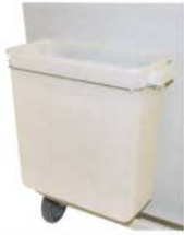
684801 - Plastic 3 Gallon Waste Container with wire holder mounting bracket 40817 - Plastic 3 Gallon Waste Container