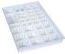
68640 - P1 Drawer Tray with Adjustable Dividers for Standard Line and OptimAL Line Medication Carts: SL600PC, SL400PC, AL600PC, WD460PC, SL294BOX, SL210BOX, AL420BOX, AL294BOX, AL210BOX, SL54BIN3, SL36BIN5, SL42BIN3, SL28BIN5, SL30BIN3, SL20BIN5