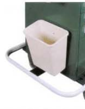
680408 - Plastic 2 Gallon Waste Container with mounting hardware