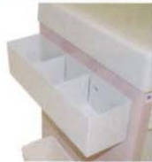
AL2359 - Cup and Straw Holder, three sections, without lid AL2358 - Cup and Straw Holder, three sections, with lid Dimensions: 5.5"H x 19.5"W x 5"D