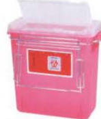
683840 - 3 Gallon Sharps Container with wire holder and mounting bracket 40838 - Sharps Bracket for the 3 Gallon Sharps Container 40836 - Replacement 3 Gallon Sharps Container