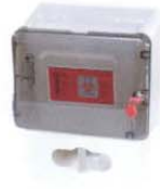
680445 - Locking Sharps Holder with Glove Box Holder, includes 5 Quart Sharps Container 40837 - Replacement 5 Quart Sharps Container 680445 - Glove box only (only used with 680445 and 684810)