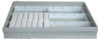
680510E - Value Line Unit-Dose Box Divider Set 680553 - Standard and OptimAL Line Unit-Dose Box Divider Set for 20.25" wide draws 680554 - Standard and OptimAL Line Unit-Dose Box Divider Set for 27.5" wide draws