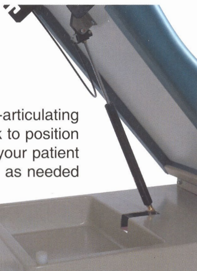
Fully-articulating back to position your patient as needed