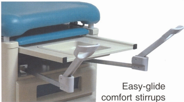
Easy-glide comfort stirrups